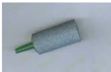
Bubble Stone for ozone generator